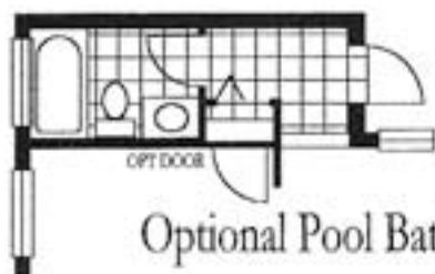
Optional Pool Bath